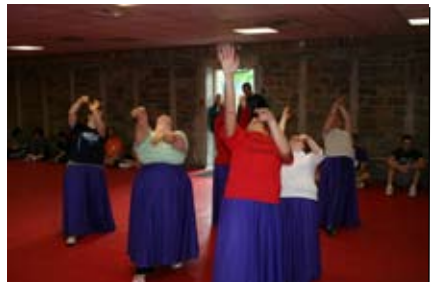
SEC Dance Company