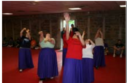
SEC Dance Company