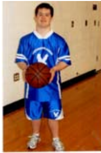
Partners in Sports