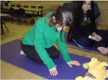
Yoga, Spring 2009