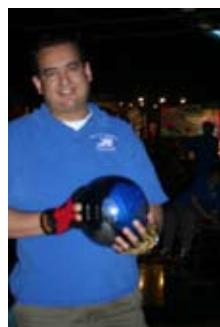
Bowling Program, New Roc City Bowl