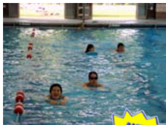
Free Swim, Hommocks Pool