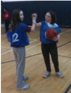
Kids in Motion, Eastchester Program