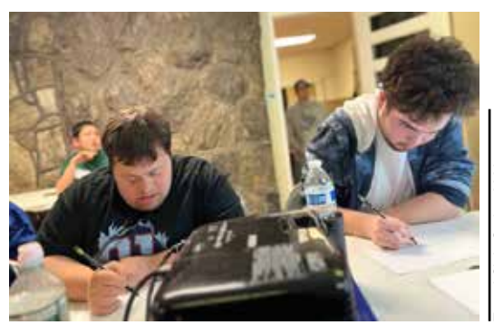
ravel Club, Spring 2023