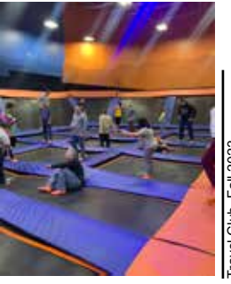
ravel Club, Fall 2023

OPWDD/Waiver Confirmed: $66.00 Group Home/TRANSITIONAL: $78.00