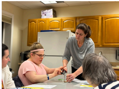
Mix it Up 2026