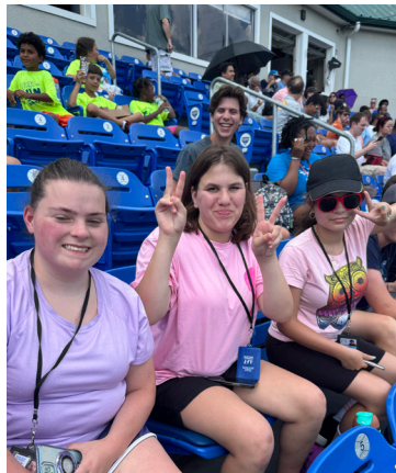
Hudson Valley Renegades, 2025