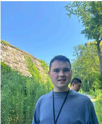
Teen Life 2025