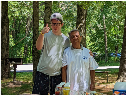
End of Year BBQ